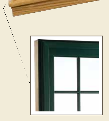
Exterior Finish (shown in Forest Green)